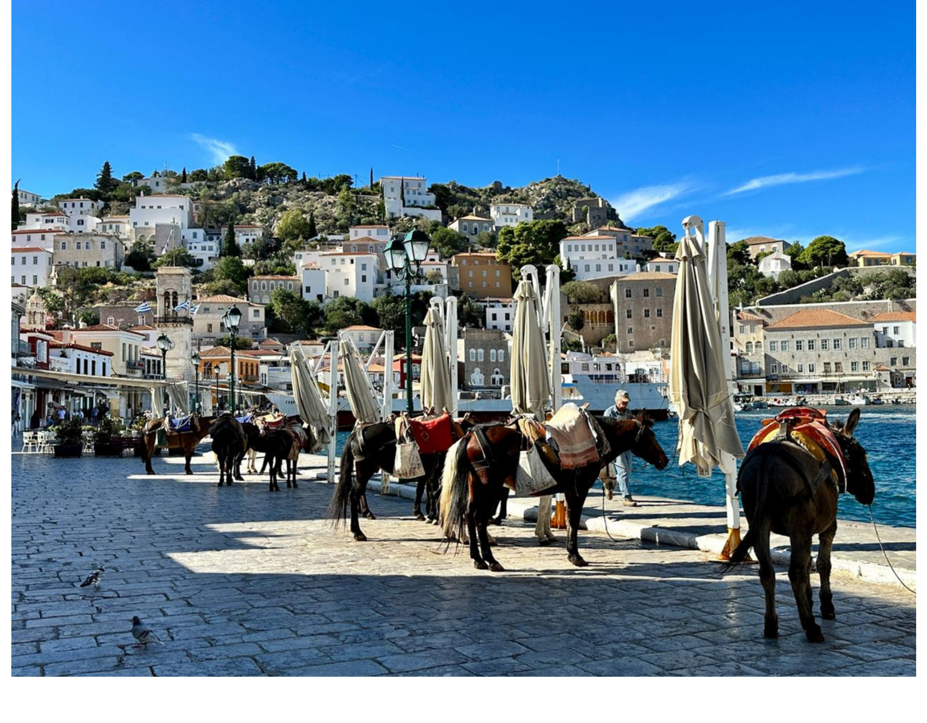
The port of Hydra